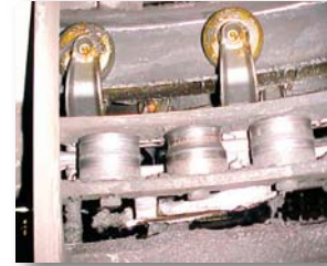
Rollers shown need to be replaced because of severe wear.

Health Assessments of your manufacturing systems including conveyors, process tooling and other equipment can be one of the best investments you make to minimize lost production and the costs associated with catastrophic failures. It can literally pay for itself many times over by allowing you to anticipate failures and plan remediation rather than react to it. Design Systems teams of trained engineering specialists can quickly assess your plant equipment for potential failures with no disruption to your production.